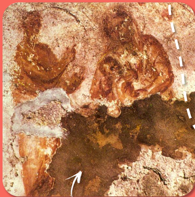
The oldest pictorial representation of the Virgin Mary, c. 150AD, preserved in the catacomb.

We visited and celebrated mass in the Catacombs of Priscilla which was another powerful moment for us. We realized how precious our Catholic heritage is thanks to the many lives given by the first Christians.