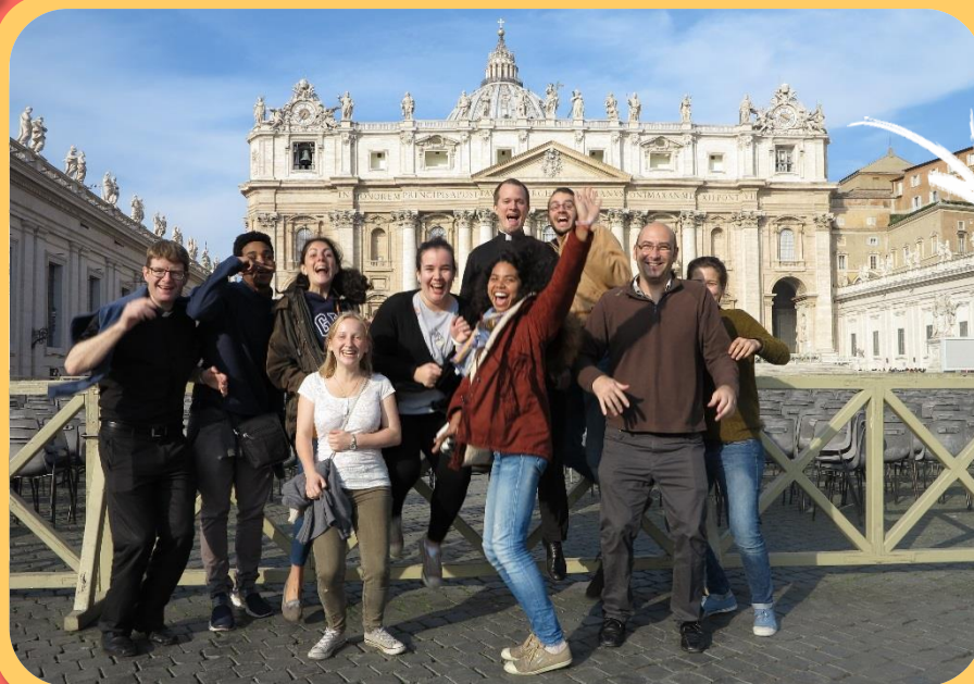
The Basilica of St Peter's (Vatican)